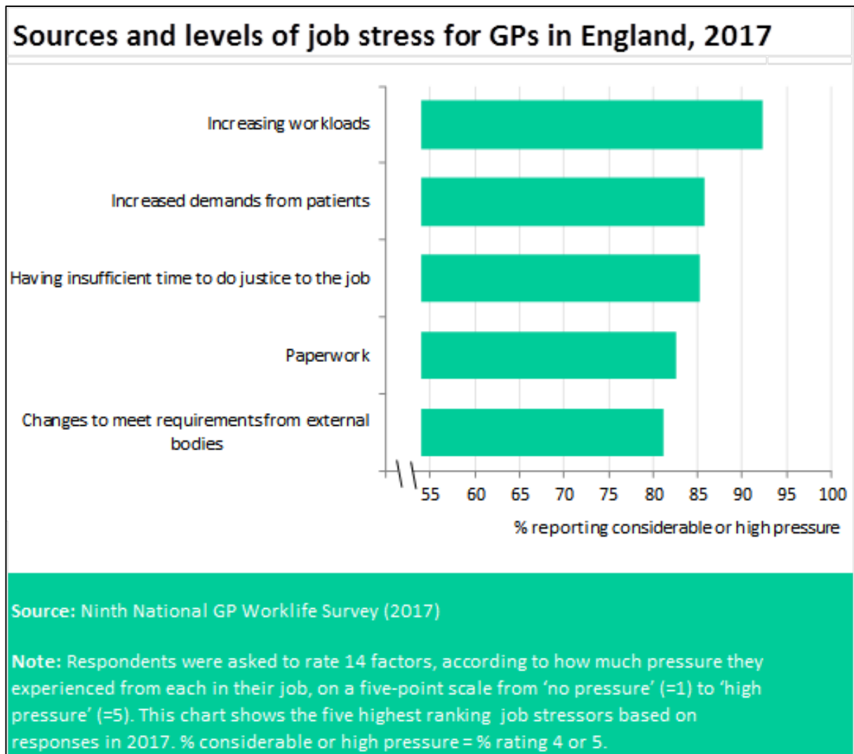
Figure 3 - Sources and levels of job stress for GPs in England, 2017